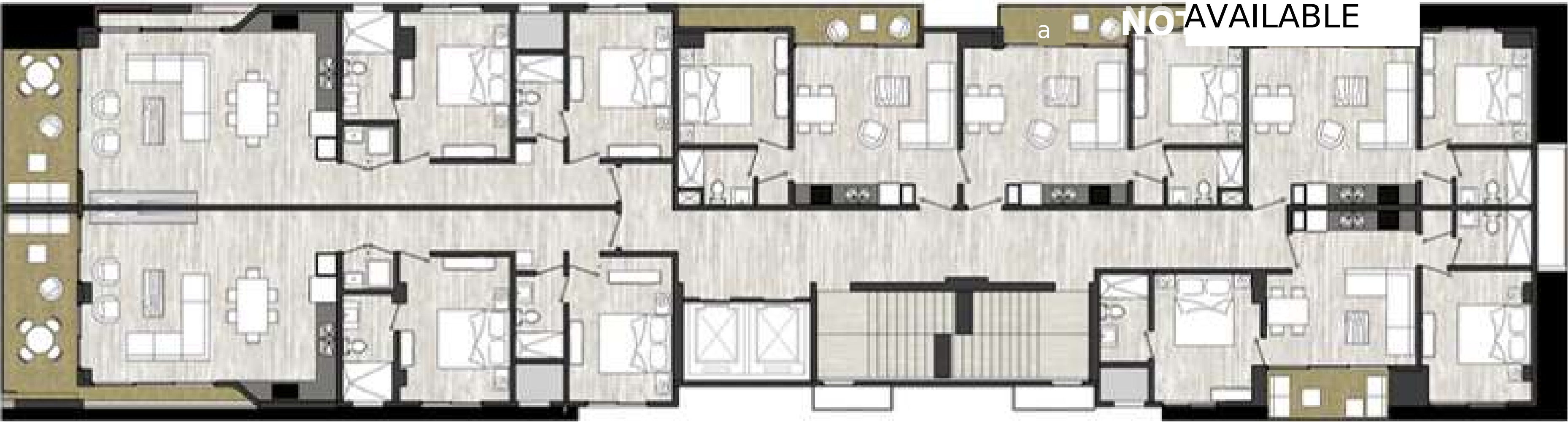
Oceanfront West Type B